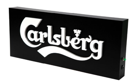
POP & POS Displays