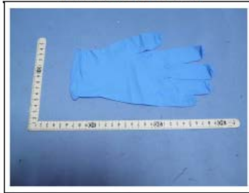
Sample as received (Size M)

SGS authenticate the photo on original report only